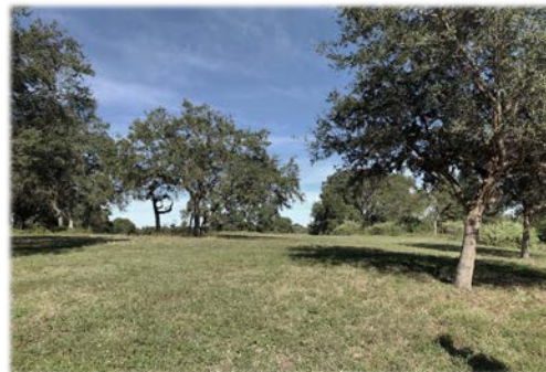
Photo: Westridge Park

The Town of Davie Town Council adopted a Historic Preservation Ordinance in 2017 through Ord. 2017-023 and updated this Ordinance in 2021 through Ord. 2021-03 to meet State Certified Local Government (CLG) requirements. The Town is responsible for administering its Historic Preservation Ordinance and carrying out the duties and responsibilities delegated by the State. The Town will meet the professional qualifications standards of the guidelines and standards of the United States Secretary of the Interior as published in the Code of Federal Regulations, 36 C.F.R. Part 61.