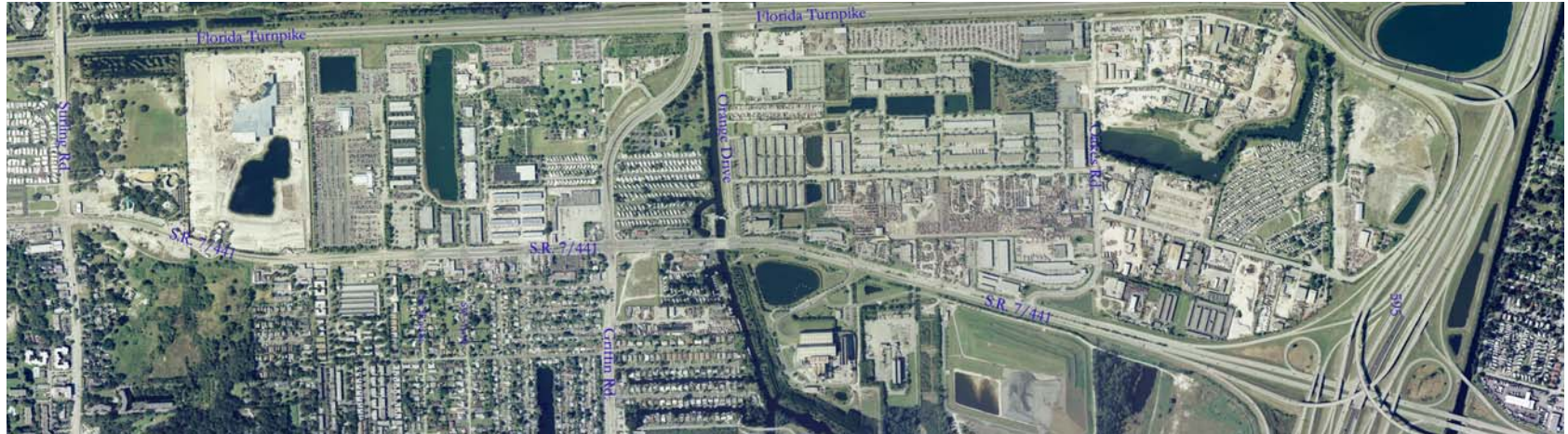
The Study Area

The study area has access to both the Florida Turnpike and I-595. The study area includes lands east and west of SR 7 between I-595 and Stirling Road. The study area includes portions of Davie, Hollywood, and the Seminole Nation.